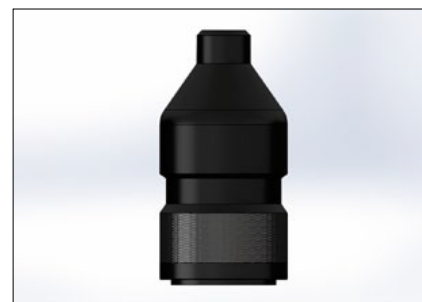
Sunnex SL3 Lamp Head